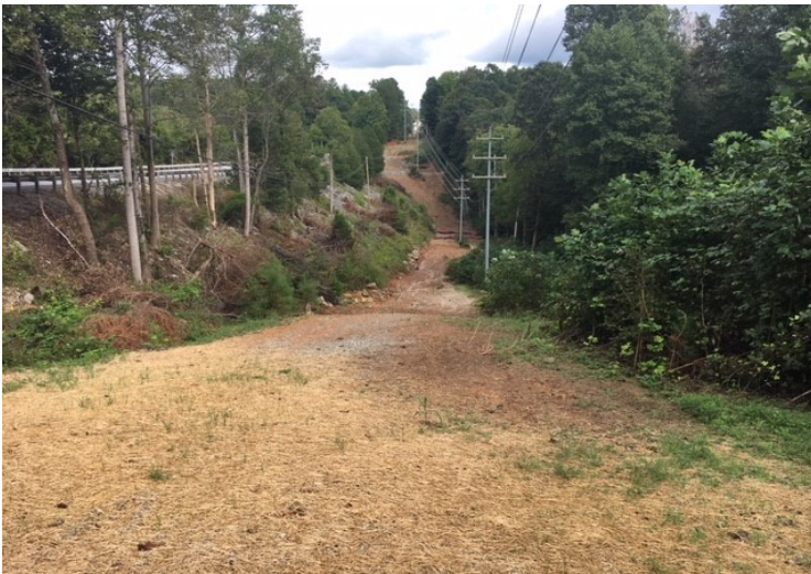
New 6-inch DIP water line reinforcing water service to Monroe and Dale Hollow Lake area Livingston, Tennessee

Construction for the Monroe Water System Improvements project, with John T. Hall Construction of Sparta, TN being the lower bidder at $1,562,395, is 95 percent complete. The project consists of 33,000 L.F. of 6 and 8-inch water line and has a completion date of September 2018. All water lines have been installed and the Contractor is working on punch list items.