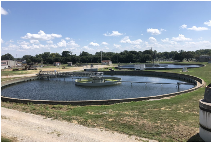
Clarifiers No. 1 & No. 2 North Wastewater Treatment Plant Henderson, Kentucky

Contract documents were provided for the Owner's use in bidding the South WWTP Scada Expansion project which is funded by a $285,000 DRA grant. Construction of the North Wastewater Treatment Plant Final Clarifiers No. 1 & No. 2 Rehabilitation project is complete.