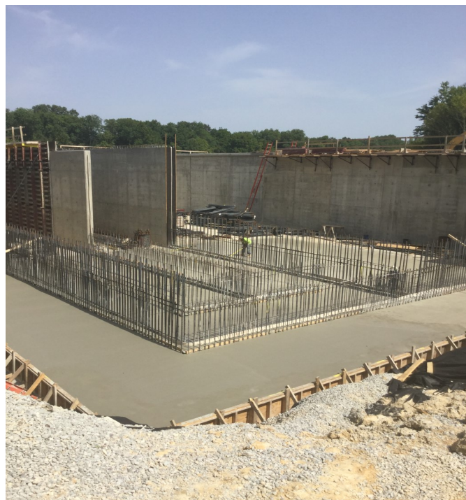
1.6 MGD SBR WWTP Trenton, Tennessee