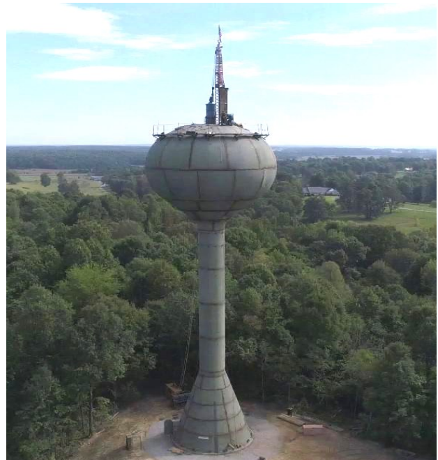
250,000 Gallon Pedosphere Water Tank Progress Madisonville, Kentucky

Construction of Contract 17-01, 10,000 L.F. of new 6 & 8-inch water lines and a new booster station has begun with Bobby Luttrell & Sons, LLC the low bidder at $675,446. Phoenix Fabricators and Erectors, LLC is the low bidder for Contract 17-02, the new 250,000 gallon tank at $734,500. The new 250,000 gallon elevated tank for the new north high pressure zone project is nearing completion with welding and painting remaining. The pipework is complete and the Contractor is awaiting pump station delivery for Contract 17-01.