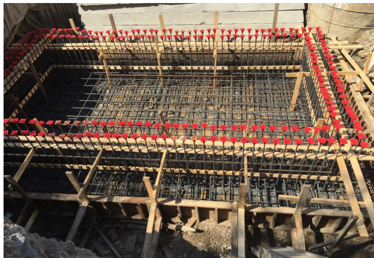
Concrete Reinforcing Steel for the Shelbyville Shoffner-Bomar Sewage Pumping Station Shelbyville, Tennessee

The IWS and Local Limits have been submitted to the State for preliminary approval before adoption. Bids for the 2017 CDBG Phase III Sewer Rehab project have been received with John T. Hall Construction, Inc. of Sparta, TN being the low bidder at $770,470.