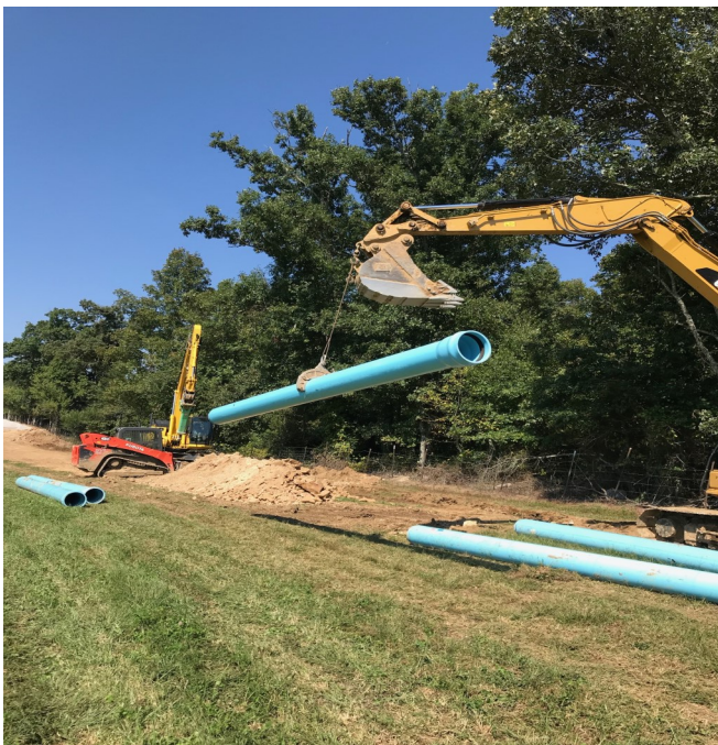
Contractor laying water line pipe for the Industrial Development Board (IDB) of Fentress County, for the 12-Inch Water Transmission Line

Construction on the 12-inch Water Transmission Line from FCUD's Clarkrange Tank to the Industrial Park has begun with John T. Hall Construction, Inc., of Sparta, TN being the Contractor at $376,717.05. The project is 55 percent complete. The project is being funded through a TN ECD Site Development Grant for the Fentress County Industrial Development Board.