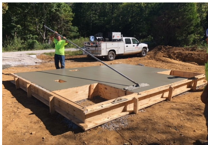
Booster Station Foundation Being Poured Madisonville, Kentucky